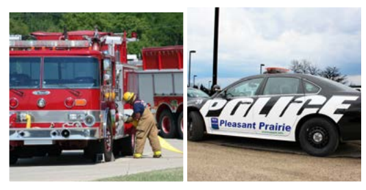
49% will be invested in public safety services, including police, fire and rescue

The majority of 2018 budget dollars (approximately 69%) will be used to provide public safety services, such as police, fire and rescue, and public works services, such as snow plowing, road maintenance, and similar work. The remaining amount (roughly 31%) will be used to: pay down existing debt, finance General Government's day-to-day operations, operate a Community Development Department, and maintain the Village parks. Percentages* for each area are shown below.