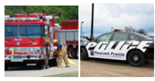
48% will be invested in public safety services, including police, fire and rescue

The majority of 2019 budget dollars (approximately 68%) will be used to provide public safety services, such as police, fire and rescue, and public works services, such as snow plowing, road maintenance, and similar work. The remaining amount (roughly 32%) will be used to: pay down existing debt, finance General Government's day-to-day operations, operate a Community Development Department, and maintain the Village parks. Percentages* for each area are shown below.