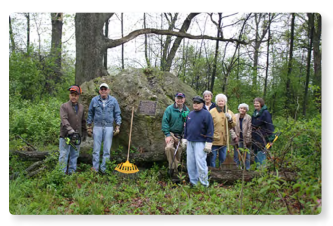
Volunteers performing maintenance at the Jambeau Trail in Momper's Woods in 2012.

On April 2 at 2:00 p.m., members of the Kenosha County Archeological Society are planning to meet at the site of the historic Jambeau Trail located in Momper's Woods in Pleasant Prairie. The group will work to clear invasive plant species from the site as part of ongoing maintenance to protect this historic location.